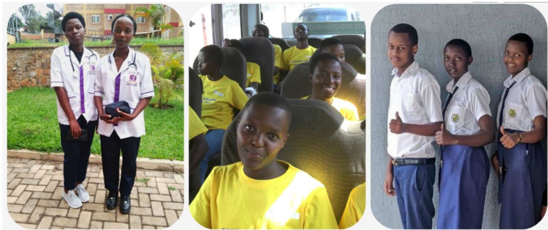
Ex-students during their hospital internship, and students at school and on a workshop trip

The Trustees have regard to the Charity Commission's public benefit guidance in exercising any powers or duties to which the guidance is relevant. There are no employed staff and none of the trustees receive any remuneration.