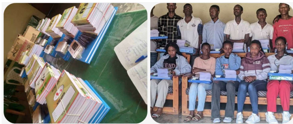
School materials assembled and distributed for a new term, September 2023

The charity's appointed local partner administers in-country activities comprising scheme promotion, completion of sponsorship forms, school visits, home visits and the administration of school fees, school materials and student travel expenses. The local partner has a dedicated bank account for the receipt and distribution of funds. Money is transferred on a termly basis.